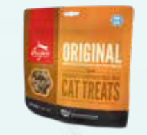
35 G / 1.25 OZ

"WHAT GREATER GIFT THAN THE LOVE OF A CAT?" CHARLES DICKENS | DIVA FROM SASKATCHEWAN