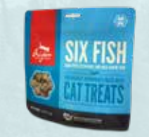
35 G / 1.25 OZ

ANALYSIS: Protein 45%, fat 35%, fibre 1%, moisture 2%.