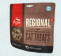
35 G / 1.25 OZ

ANALYSIS: Protein 55%, fat 15%, fibre 1%, moisture 2%.