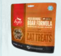
35 G / 1.25 OZ

ANALYSIS: Protein 35%, fat 45%, fibre 1%, moisture 2%.