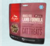
35 G / 1.25 OZ

ANALYSIS: Protein 40%, fat 35%, fibre 1%, moisture 2%.