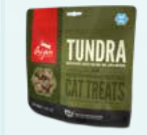
35 G / 1.25 OZ

ANALYSIS: Protein 40%, fat 40%, fibre 1%, moisture 2%.